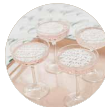
BESPOKE PRINTED GARNISH