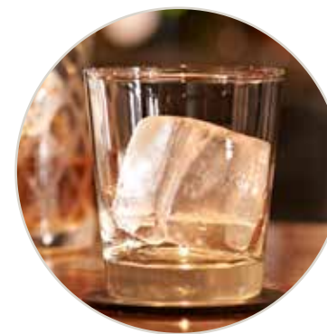
GIANT ICE CUBES