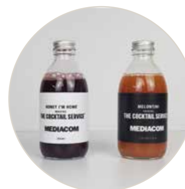
BRANDED COCKTAIL BOTTLES