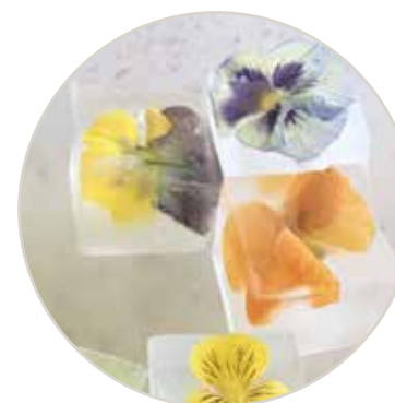
ICE CUBES WITH FLOWERS