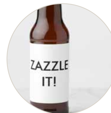
BRANDED BEER BOTTLES