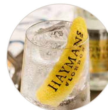
BRANDED FRUIT PEEL