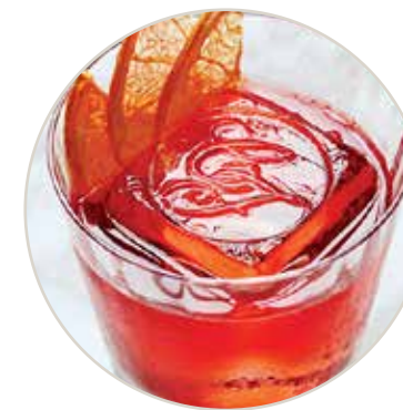
BRANDED ICE CUBES